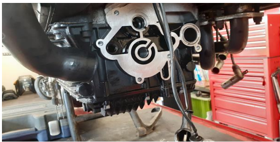
New oil pump shaft and seal fitted