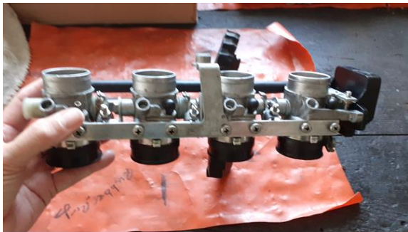
All new seals – Ultrasonic cleaned